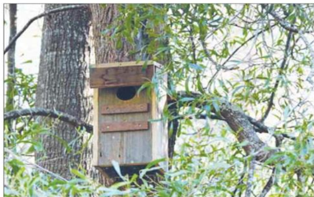
Just some of the 100 nest boxes made and donated to help wildlife recovery after the 2019-20 bushfires. (PS)

"With so many losses still obvious in the landscape, we are extremely grateful for the resourcing offered by people to be able to at help our wildlife recover and repopulate the forests."