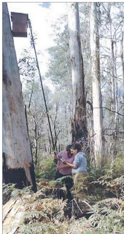
The pole camera uses a remote control with a screen to check for wildlife. (PS)

SNOWYRIVERMAIL.COM.AU | WEDNESDAY, MARCH 23, 2022